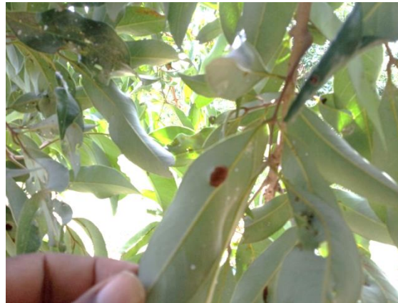
Mite infestation in Litchi

Diseases: Blight disease incidence (20%) was observed.