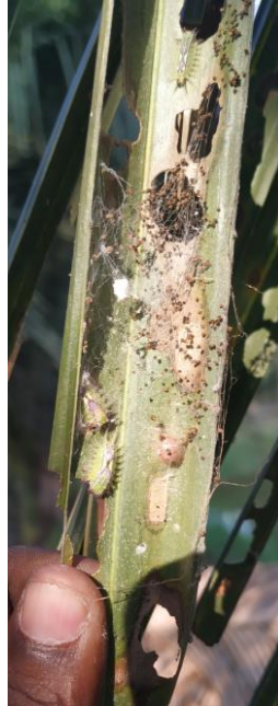
Slug caterpillar damage

Insects: Low to moderate infestation of slug caterpillar was observed.