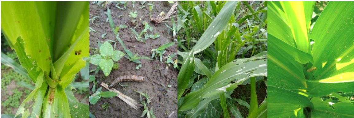
Fall armyworm damage in maize

Insects: Moderate infestation of fall armyworm was observed.