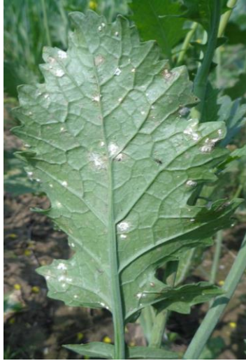
White rust disease