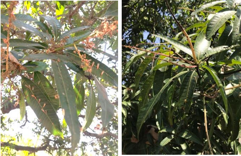
Severe damage by mango looper