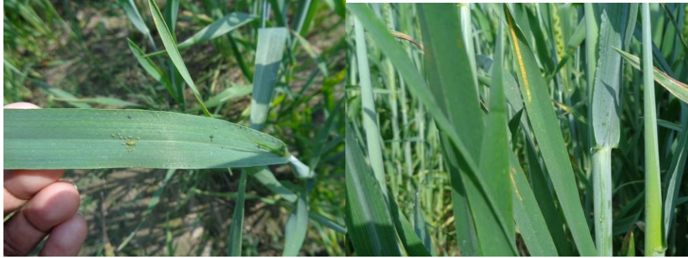
Aphids in wheat