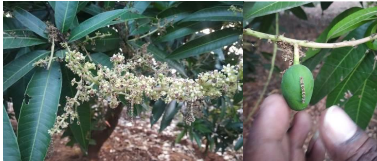
Severe inflorescence damage by mango looper