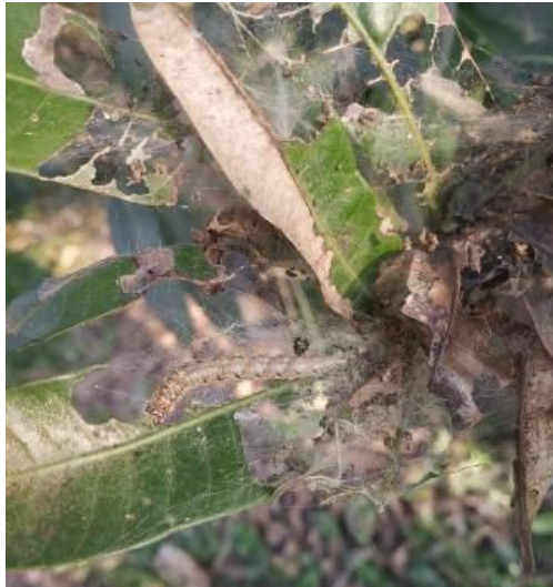
Severe mango leaf webber damage