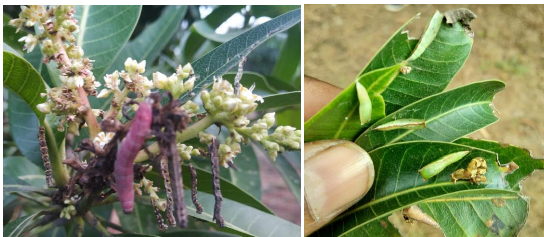
Severe damage by Mango Semilooper

Insects: Severe infestation of mango semilooper (10-80%; more than 20 larvae / panicle) damage was observed. Severe infestation by thrips was observed.