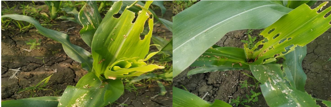
Damage by fall armyworm

Insects: Moderate infestation of fall armyworm was observed.