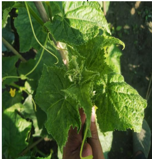
Damage by whitefly

Insects: Moderate infestation of whitefly was observed.