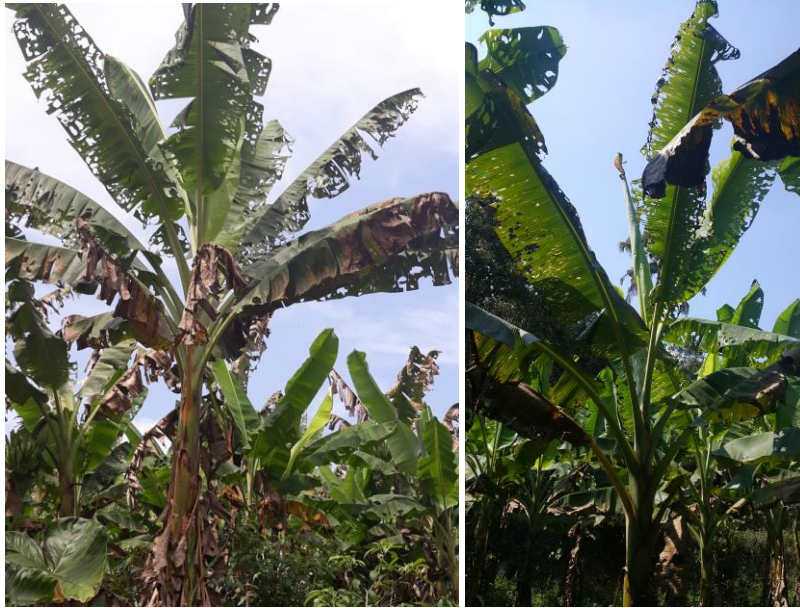
Severe damage by Slug caterpillar