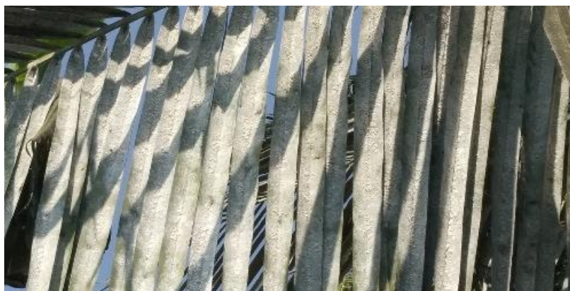
Severe Rugose spiraling whitefly damage

Insects: Moderate to Severe infestation of Rugose spiraling whitefly was observed.