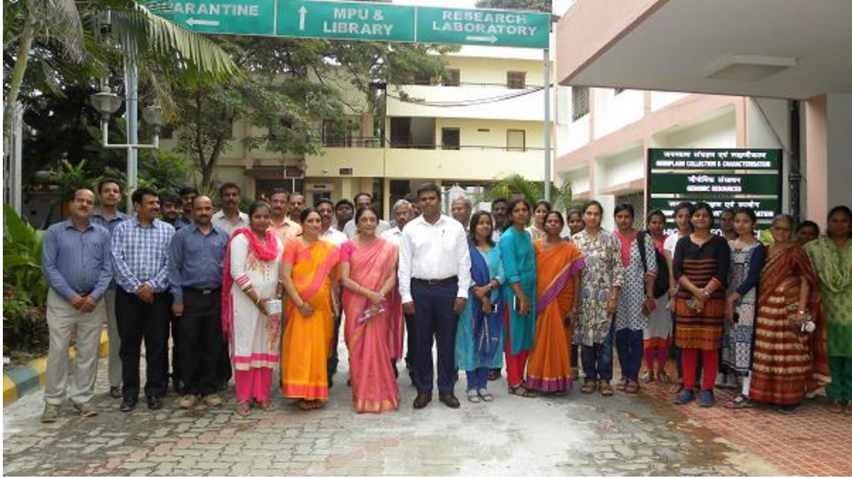
Group photo of the workshop on SwachhBharath Hi Sewa activity