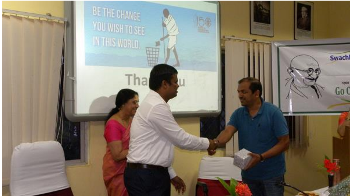
Prize distribution for the winners in Poem writing and other competition