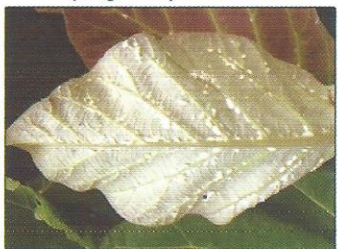
Infestation on teak