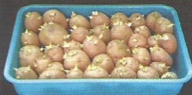
Induction of eye buds in potatoes for multiplication of mealybugs