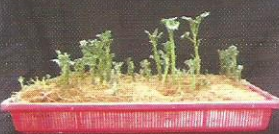
Potato shoots ready for infestation with mealybugs

The NBAII has mass multiplied the parasitoids successfully in the laboratory on Paracoccus marginatus colonies grown on potato sprouts and shoots. Parasitoids could parasitize and develop on mealybugs cultured on other host plants also. Entomologists of State Agricultural Universities, ICAR institutes, KVKs, Central IPM centers, Government biocontrol laboratories and Central Sericulture Research and Training Institute have been trained by the NBAII on the mass production, field release and conservation of the parasitoids.