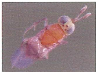
Acerophagus papayae The most promising of the three imported parasitoids

The NBAII is now supplying all three parasitoids to entomologists all over India for field release and conservation. Field release of the parasitoids has been authorized by the Plant Protection Advisor to the Government of India. It is crucial that the released parasitoids as well as naturally occurring predators like Spalgis and Cryptolaemus are conserved by avoiding the use of chemical pesticides for the effective suppression of the papaya mealybug. If properly mass produced, released and conserved, the parasitoids are expected to bring about significant suppression of the papaya mealybug populations within six months to one year.