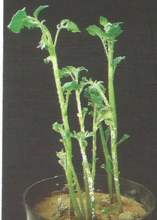
Mealybugs being raised on potato shoots

The NBAII has mass multiplied the parasitoids successfully in the laboratory on Paracoccus marginatus colonies grown on potato sprouts and shoots. Parasitoids could parasitize and develop on mealybugs cultured on other host plants also. Entomologists of State Agricultural Universities, ICAR institutes, KVKs, Central IPM centers, Government biocontrol laboratories and Central Sericulture Research and Training Institute have been trained by the NBAII on the mass production, field release and conservation of the parasitoids.