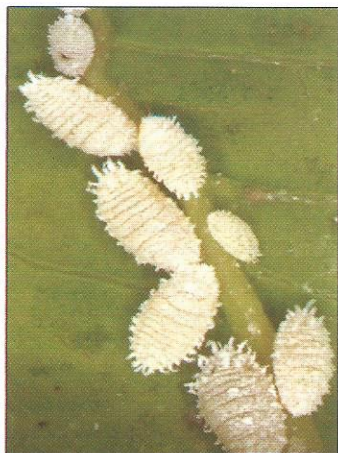
Nymphs and adults of Paracoccus marginatus