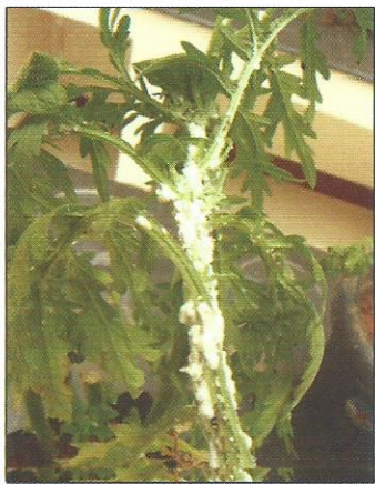
Mealybug colony on Parthenium