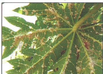
Mealybug infested papaya leaf