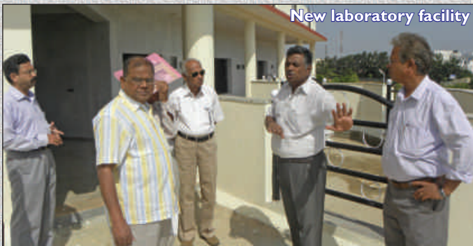
New laboratory facility