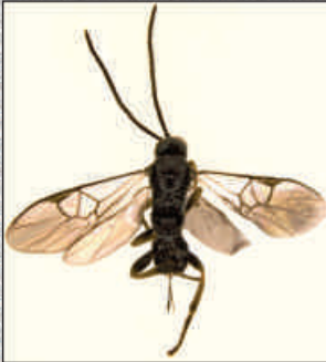
Fig. 1: Dolichogenidea sp.

Xanthopimpla elegans (Fig. 2), a larval parasitoid of Syllepte derogate , was collected for the first time from Middle Andamans.