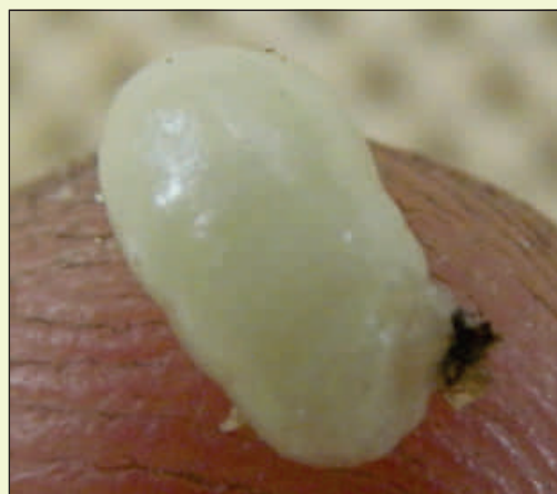
Sac-like water-filled body of the larva

infected colony, the adults become sluggish and do not go out for foraging while the queen gradually stops laying eggs. The presence of sac-like diseased larvae scattered on the bottom board is an indication of TSBV.