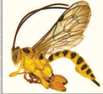
Fig. 2: Xanthopimpla elegans