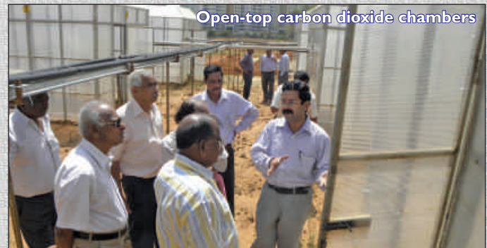
Open-top carbon dioxide chambers