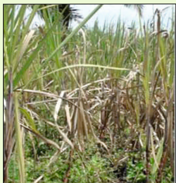
Wilting of sugarcane plants

Soil insect pests including whitegrubs, cutworms, termites and root grubs cause 24–40% yield losses in sugarcane, corn, arecanut, cardamom, groundnut, potato, banana, guava, turmeric, pulses, vegetables, grasses, etc. with direct plant loss to the tune of 20–60%. The larvae of root-feeding insects remain underground near the root zone of the plant, feeding upon the roots resulting in yellowing, wilting of leaves and drying of the entire plant. Due to continuous depletion of forest cover, organic carbon, soil microbial activities, antagonistic potential and ecological services of natural soil summarily attributed to anthropogenic and geological events, the soil-borne insect pests are increasingly invading the crops and causing a serious threat.