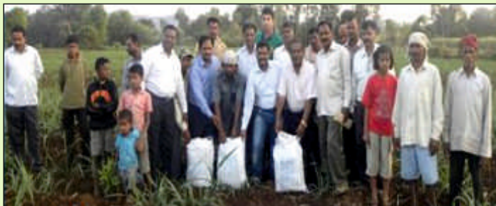
Field demonstration of EPN technology for management of whitegrubs