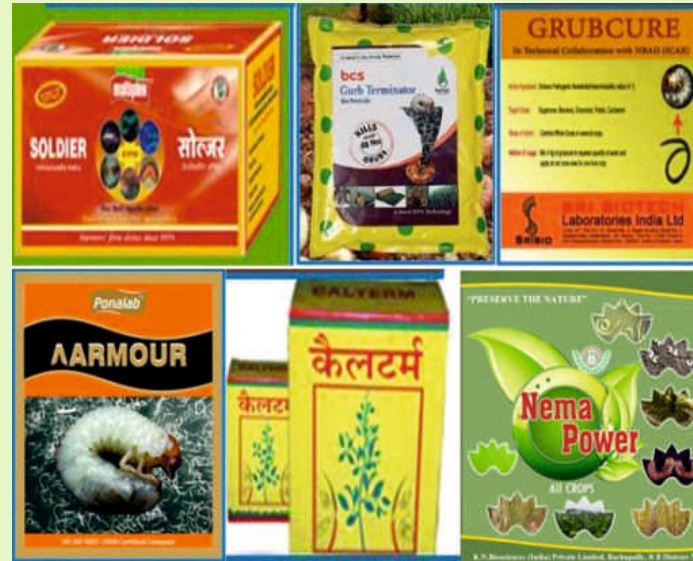
Commercial products of ICAR-NBAIR EPN formulation

The EPN technology entitled "Development of novel insecticidal wettable powder formulations of Heterorhabditis indica strain NBAII HI1 and Heterorhabditis bacteriophora strain NBAII HB5 for the biological control of white grubs and other insect pests" was transferred non-exclusively to 16 companies and a revenue of 28 lakhs was generated in 5 years (2012-17) through transfer of license and royalty. Further, the technology could meet the enormous demand-supply-requirement in the country for EPN by successfully establishing supply chain through IP protection, licensing and public-private partnership.