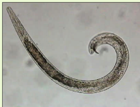
Entomopathogenic nematode, Steinernema sp.

Entomopathogenic nematodes (EPN) belonging to the families Heterorhabditidae and Steinernematidae are microscopic, non-segmented roundworms that are obligate parasites of insects and have become important in biological control and integrated insect pest management as biopesticides. EPN occur naturally in soil environments, locate their host in response to carbon dioxide and chemical cues from hosts. EPN infect many different types of soil insects and their life stages, larval, pupal and adult forms of lepidopteran, coleopteran and dipteran pests, as well as adult crickets and grasshoppers. These nematodes working with their symbiotic bacteria ( Xenorhabdus and Photorhabdus ) in their gut, can kill their insect hosts within 24–48 hours.