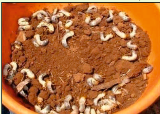
White grubs collected from infested sugarcane