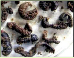
Cadavers of whitegrubs