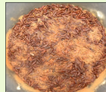
Mass production of EPN in Galleria mellonella

Nematodes are amenable to mass production and their application is compatible with standard agrochemical equipment, including various sprayers and irrigation systems. Under in vivo mass production, wax moth ( Galleria mellonella ) larvae are inoculated with the infective juveniles (IJs) of respective EPN and are allowed for infection and mass multiplication. The IJs are harvested later from the dead cadavers of G. mellonella .