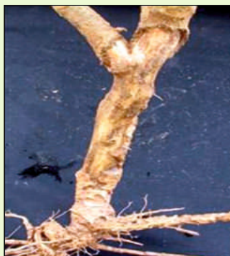
Ash weevil damage in brinjal