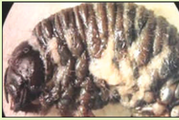
Entomopathogenic nematodes emerging from a whitegrub cadaver