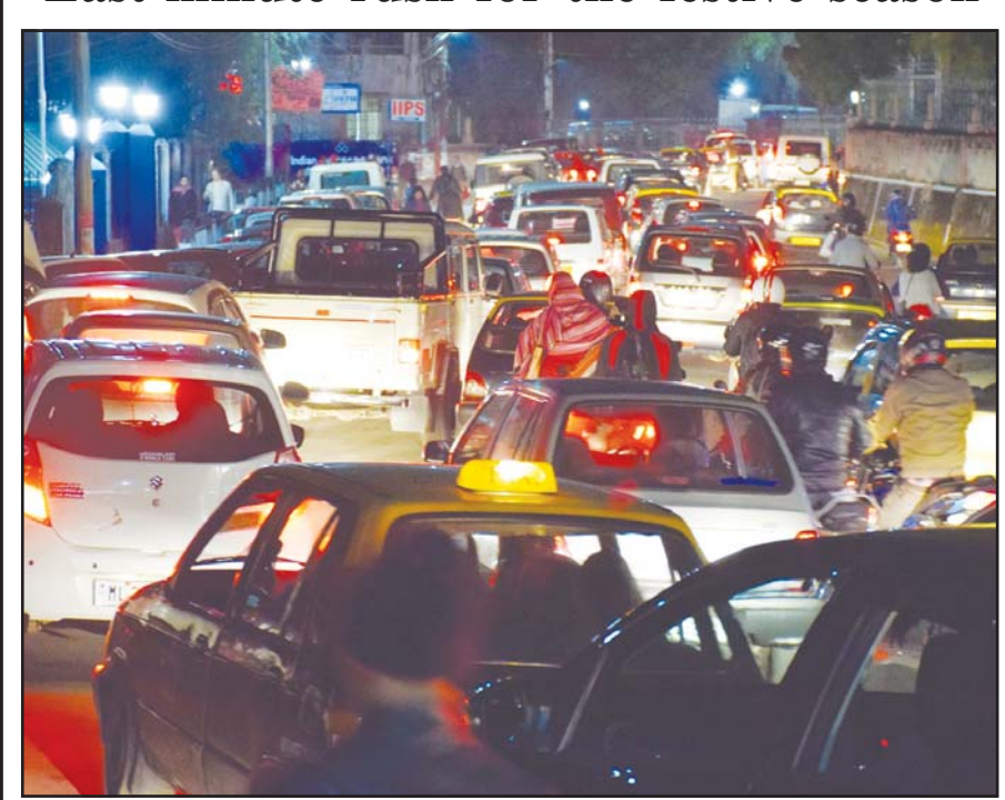
With only two days left for Christmas, people came out in hordes on Saturday for shopping that created traffic snarl in the city. (ST)