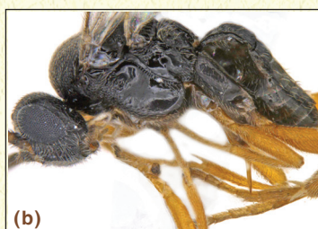
Fig. 1: New Parapanteles sp.: (a) Dorsal view; (b) Lateral view