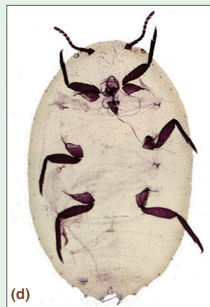
Phenacoccus solani : (a) Adult female; (b) Natural colony; (c) Colony raised on a potato sprout in the laboratory; (d) Microscopic preparation of an adult female